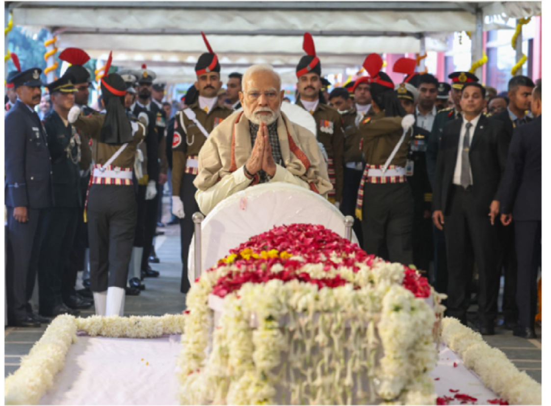
Prime Minister, Shri Narendra Modi pays last respects to former Prime Minister, Dr. Manmohan Singh at Nigam Bodh Ghat, in Delhi on December 28, 2024.