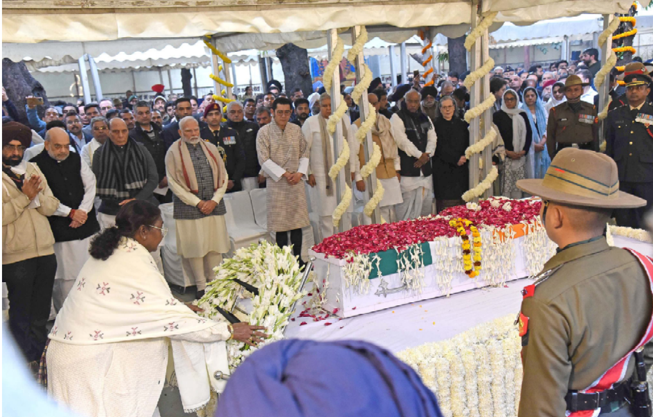
The President of India, Smt. Droupadi Murmu pays last respects to former Prime Minister, Dr. Manmohan Singh at Nigam Bodh Ghat, in Delhi on December 28, 2024.